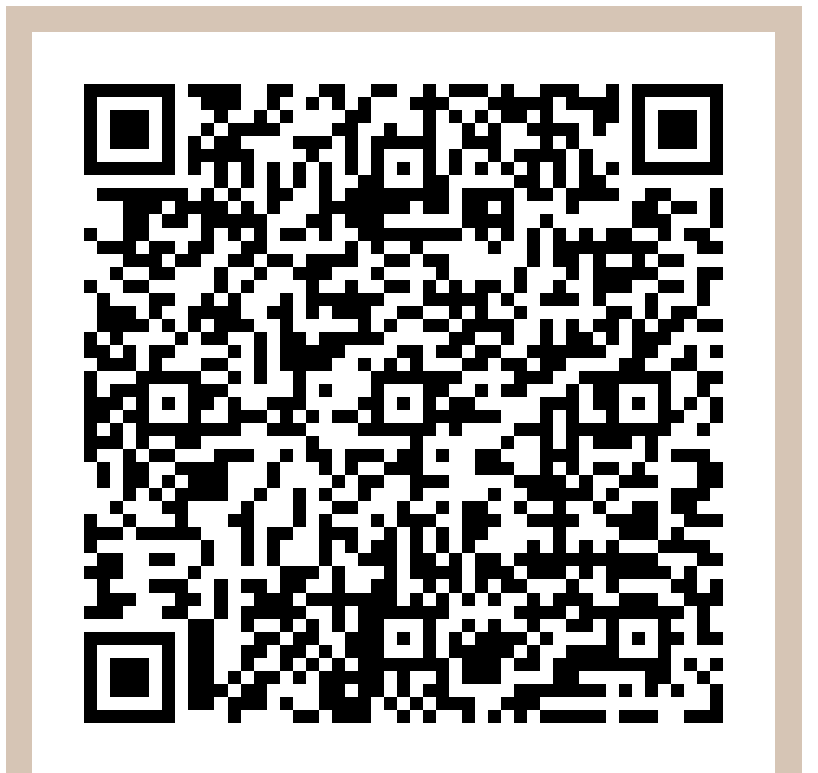
Scan the code above with your mobile device or click it to go directly to the Celebrity Homes & Townhomes website for 8106 S 199 Street, Gretna, Ne 68028