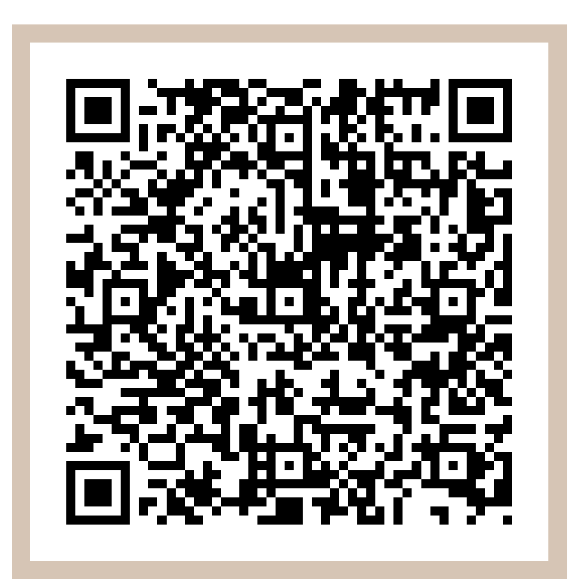
Scan the code above with your mobile device or click it to go directly to the Celebrity Homes & Townhomes website for 17602 Phoebe Street, Elkhorn, Ne 68022