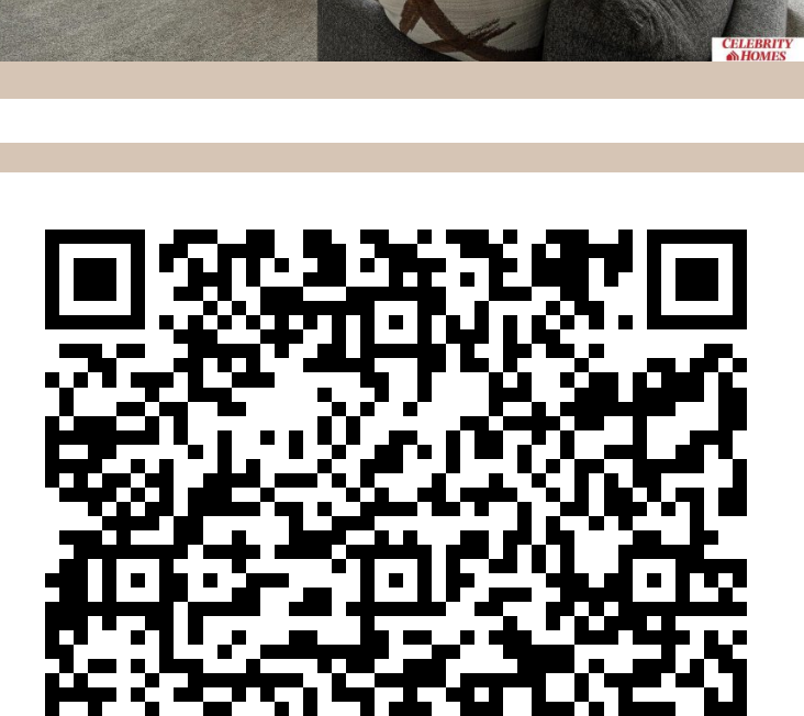
Scan the code above with your mobile device or click it to go directly to the Celebrity Homes & Townhomes website for 8024 S 200 Street, Gretna, Ne 68028