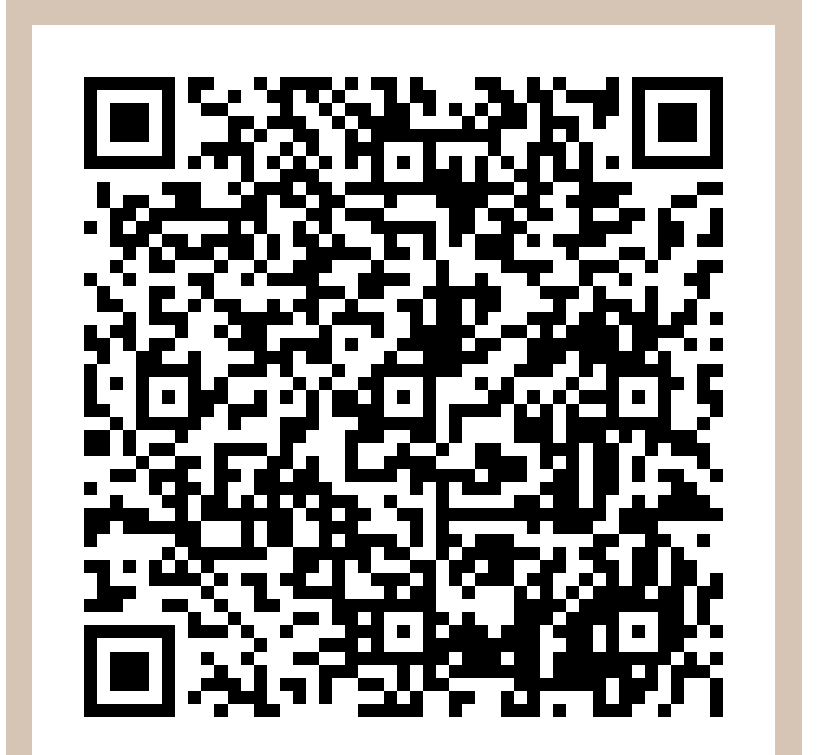
Scan the code above with your mobile device or click it to go directly to the Celebrity Homes & Townhomes website for 16920 Newport Avenue, Omaha, Ne 68116