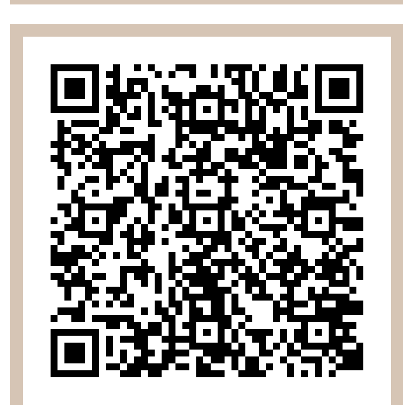
Scan the code above with your mobile device or click it to go directly to the Celebrity Homes & Townhomes website for 16907 Mary Street, Omaha, Ne 68116